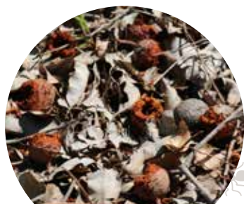
Nuts or seeds nibbled by animals