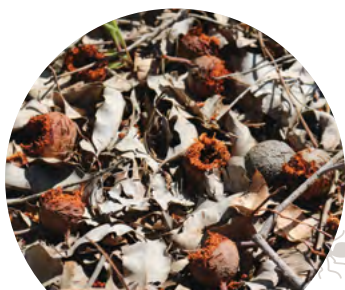
Nuts or seeds nibbled by animals